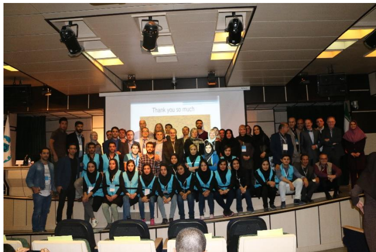
Previous ISSSS Conference held in University of Isfahan in 2015